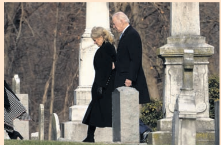
President Joe Biden and first lady Jill Biden walk between tombstones to attend Mass at St. Joseph on the Brandywine Catholic Church in Wilmington, Del., on Sunday, Dec. 18, 2022.

Biden married Jill Jacobs in 1977 and they had a daughter, Ashley. Both women joined him on Sunday, as did Hunter and many of the president's grandchildren among others at St. Joseph on the Brandywine Roman Catholic Church. After the service, the family walked